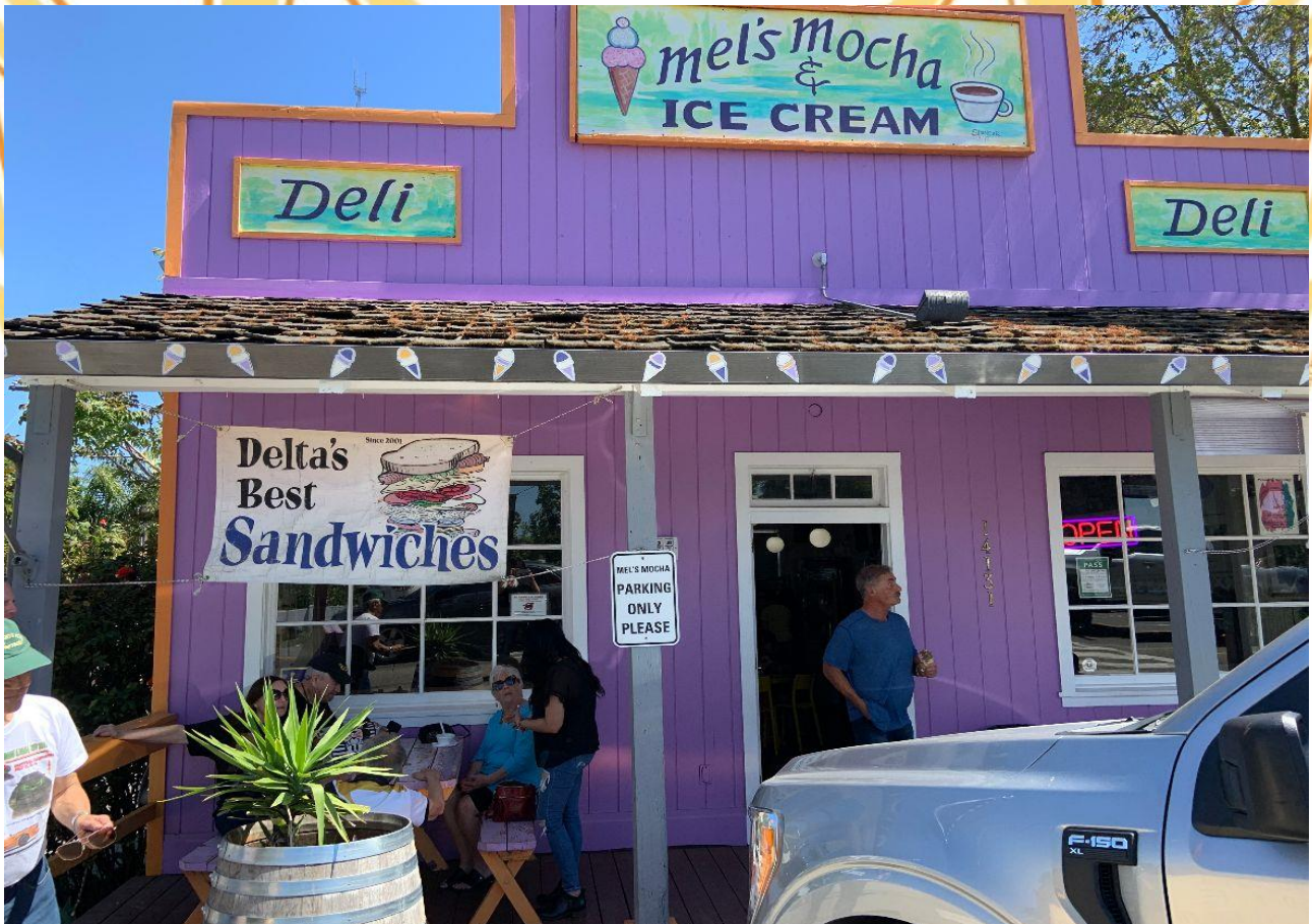
Our Ice Cream stop in Walnut Grove.