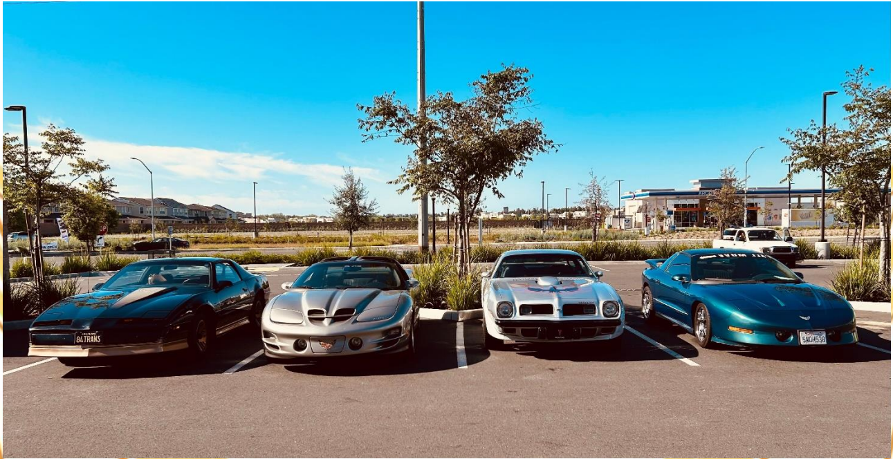
Trans Ams from left to right 1984, 2000, 1975, 1995